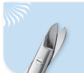
Crown & Gold Curved Scissors SCGC