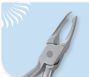
Slim Crown & Band Contouring Pliers 678-221M