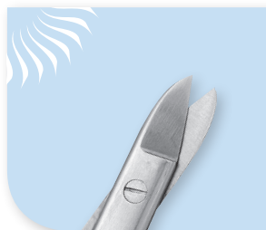
Crown & Gold Straight Scissors SCGS